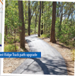
Tooley forest Ridge track path upgrade