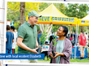
Stone with food assisted transport